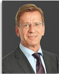
Håkan Samuelsson CEO Volvo Cars